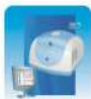
PCR/ Gradient PCR/RT PCR