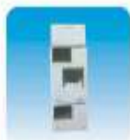
Automated GPC system