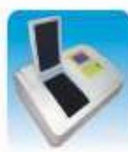
Spectro UV 2080+ Double Beam