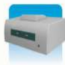
DSC / TGA