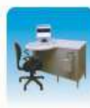
Optical Emission Spectrometer