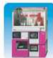
Amino Acid Analyzer