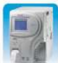
HEMA 3210 Fully-automatic Hematology Analyzer