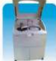
NOVA 2200 Plus Auto Chemistry Analyzer