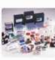
Bio-Chemistry Reagents Rapid Diagnostic kits