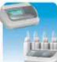
Elisa / Microplate Reader - Washer