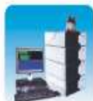
Intelligent HPLC / BioLC™ / nanoLC™