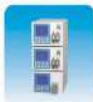
Preparative Process HPLC